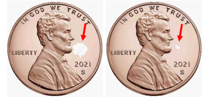
Fentanyl Lethal Dose

F entanyl is an opioid pain medication 50-100 times stronger than morphine. Carfentanyl is even more potent—100